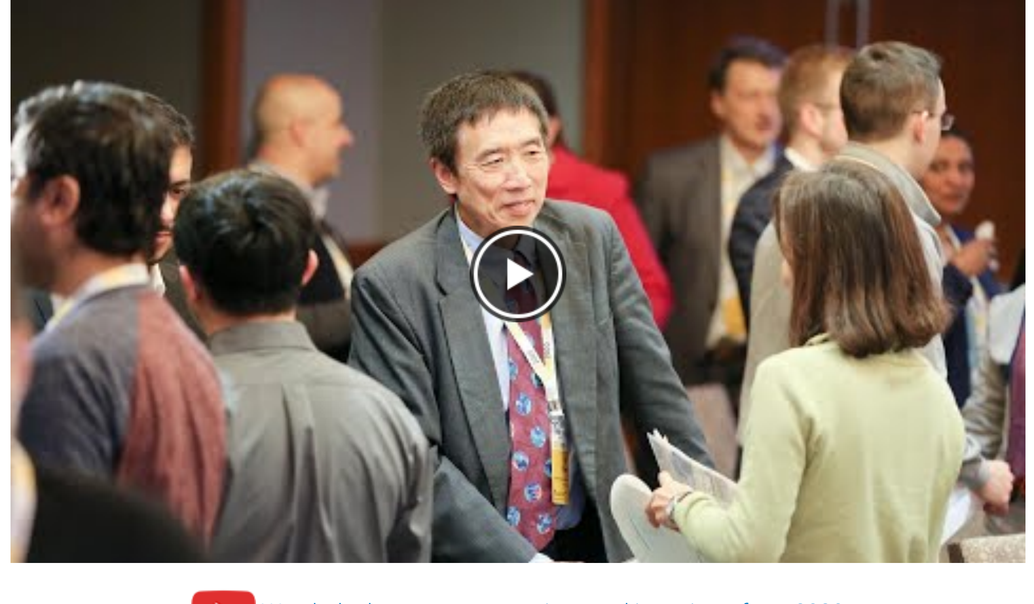
Watch the keynote presentations and interviews from 2020